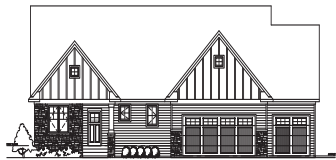
ALTERNATE FRONT ELEVATION 1