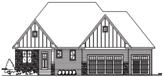
ALTERNATE FRONT ELEVATION 3