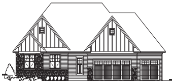
ALTERNATE FRONT ELEVATION 3