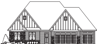
ALTERNATE FRONT ELEVATION 3