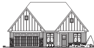
ALTERNATE FRONT ELEVATION 3