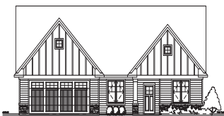
ALTERNATE FRONT ELEVATION 1