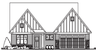
ALTERNATE FRONT ELEVATION 1