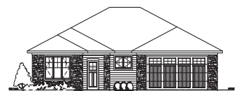
ALTERNATE FRONT ELEVATION 4