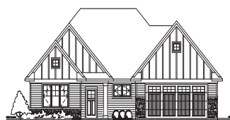
ALTERNATE FRONT ELEVATION 3