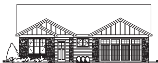
ALTERNATE FRONT ELEVATION 2